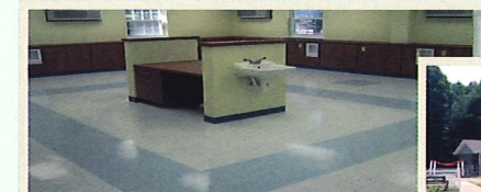
Genesis College View, MD

Ravensood, WV Pines, MD Valley Center, WV Milltree, WV Cedar Ridge, WV Silver Lake, DE Madison, DE Westwood, VA Parkersburg, WV