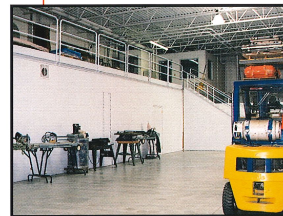
The new Pray office building contains a 4,500 square-foot warehouse for plenty of storage.

With a centralized network room and a state-of-the-art infrastructure, the offices