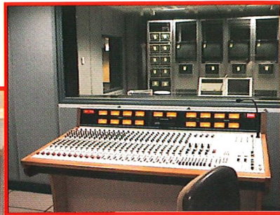
From the conference room to the control room, WPBY gets a new look.

building was occupied and fully functional! With a completion date of January 1999, the employees of WPBY have already been enjoying their new 'home' for a year now.